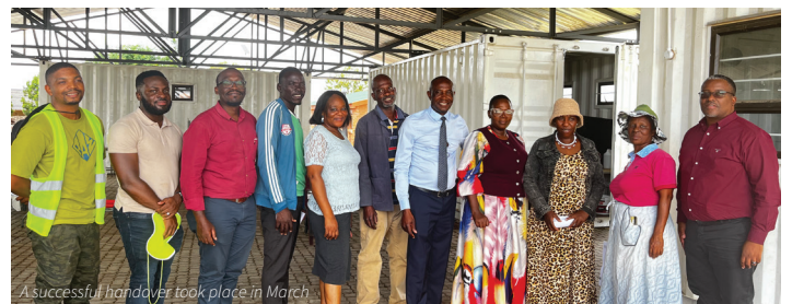
A successful handover took place in March