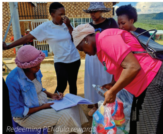
Redeeming PENdula rewards