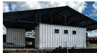
Under roof gathering area

The visit also provided an opportunity to assess system performance and reinforce operational requirements, with the school demonstrating a strong willingness to adopt recommended practices. To support this transition, maintenance services will be extended for a further six months, after which the school will take responsibility for the maintenance of the new infrastructure.