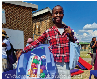
PENdula rewards include a variety of items