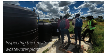
Inspecting the on-site wastewater plant