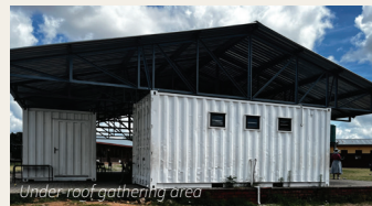
Under roof gathering area

The visit also provided an opportunity to assess system performance and reinforce operational requirements, with the school demonstrating a strong willingness to adopt recommended practices. To support this transition, maintenance services will be extended for a further six months, after which the school will take responsibility for the maintenance of the new infrastructure.