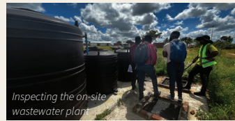
Inspecting the on-site wastewater plant