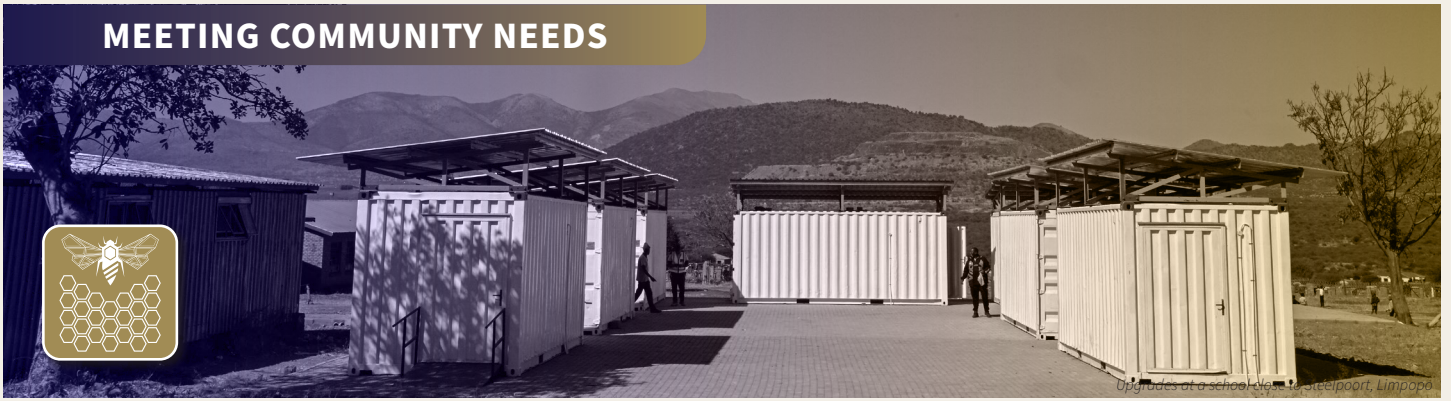
Upgrades at a school site in Limpopo