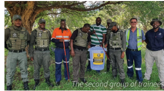
The second group of trainees

By promoting calm, informed responses and reducing potential risks, the initiative supports a safer workplace while also providing valuable knowledge that can be applied within surrounding communities.