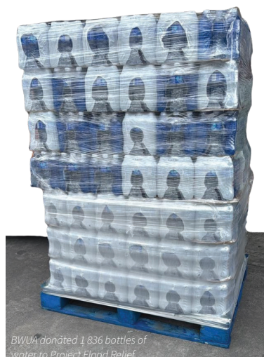
BWUA donated 1 836 bottles of water to Project Flood Relief

Thanks go to all contributors for their support.