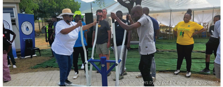
Team members trying out the new gym equipment