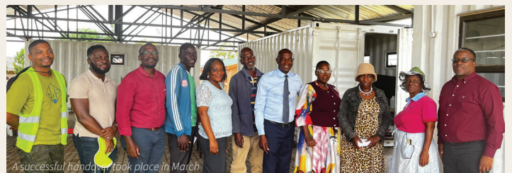
A successful handover took place in March