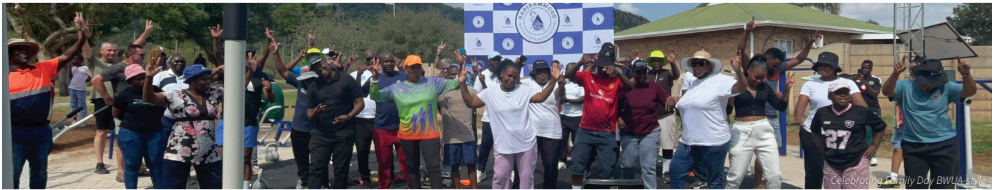
Celebrating Family Day BWUA style