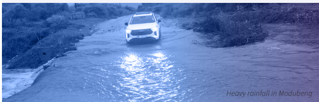
Heavy rainfall in Modubeng

Internal asset damage: While no direct asset damage occurred in January, heavy rainfall caused unexpected erosion, exposing one of the Association's chambers and partially damaging a bridge providing access to the Havercroft Pump Station. In February, a 12-ton Morris crane at Havercroft incurred minor damage caused by incorrect phase rotation. Immediate corrective actions have been completed at all affected sites.