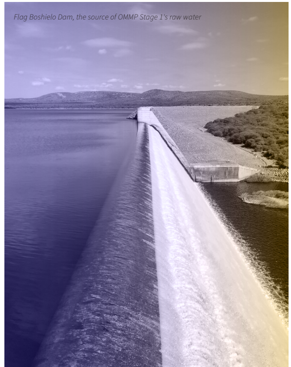
Flag Boshielo Dam, the source of OMMP Stage 1's raw water

No large-scale, commercial mining would have been possible in the Eastern Limb of the Bushveld Igneous Complex without the Association's uninterrupted bulk raw water supply. Our infrastructure has not only supported communities, it has enabled one of South Africa's most critical mineral production regions to function and grow.