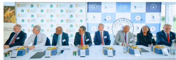
Dignitaries that participated in the signing ceremony on 12 December.