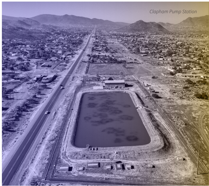
Clapham Pump Station