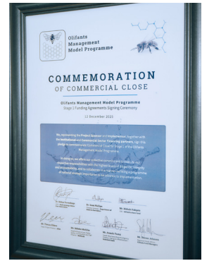
Signed commemorative plaque