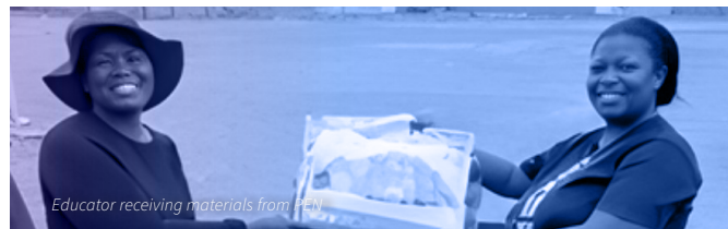
Educator receiving materials from PEN

Quality improvements are also evident. Assessments conducted at 20 of the 30 ECDs, measured twice over time, show consistent gains across health and safety, administration and staff care, and most notably education, which recorded the strongest improvement between initial and latest assessments. These results indicate that the programme is not only expanding access, but is also strengthening the learning environment and institutional capacity of participating ECD centres.