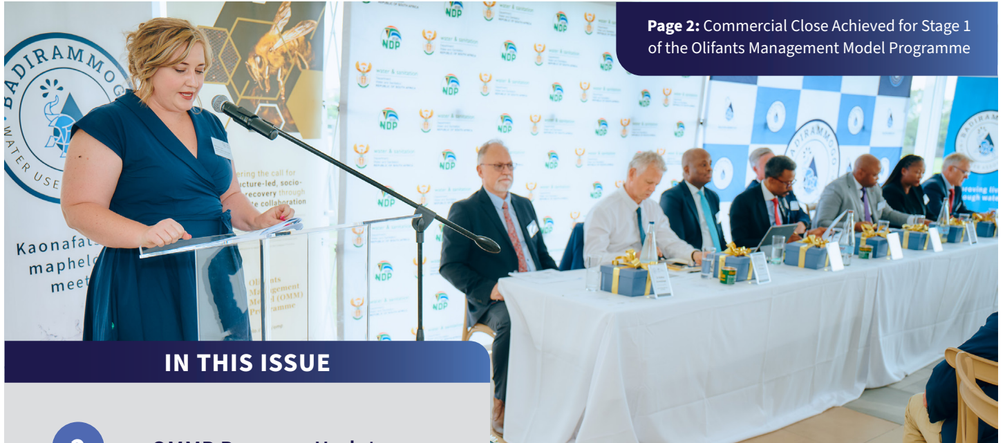
Page 2: Commercial Close Achieved for Stage 1 of the Olifants Management Model Programme