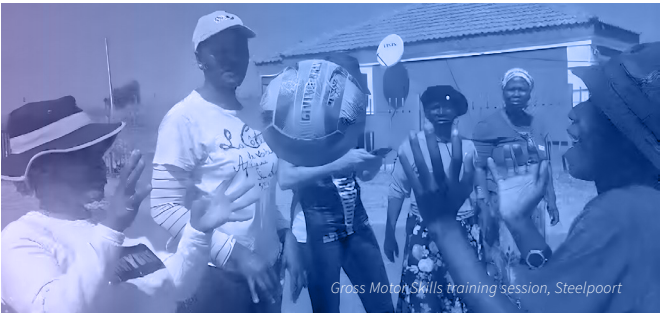
Gross Motor Skills training session, Steelport

* Includes 2 x lesson planning sessions, and 1 x gross motor skills training session.