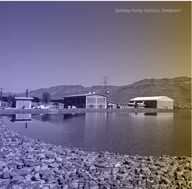
Spitskop Pump Stations, Steelport